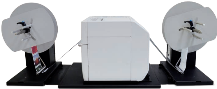
LABEL REWINDER (ASD1111-S0) - Epson TM-C3500 printer - LABEL UNWINDER (ASS1111-S0) (Not included)

The new Unwinding/Rewinding system for Epson TM-C3500 Label Printer can handle media up to 127mm (5") wide and unwind/rewind label rolls having outside diameter up to 250mm (9.84"). Units are equipped with a 3" or adjustable core holder from 40 to 118mm (1.57" - 4.64").