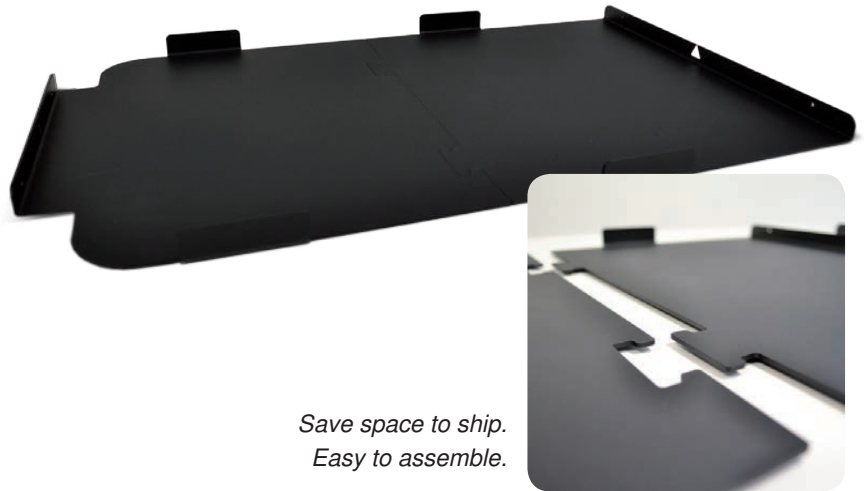
Save space to ship. Easy to assemble.

In order to guarantee a perfectly aligned media path, a specific baseplate which easily accomodates the Epson C6000A / C6500A is recommended to have a complete Roll to Roll printing station.