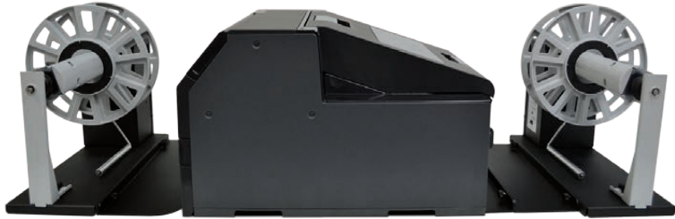
LABEL REWINDER (RW6500A) - Epson C6500A printer - LABEL UNWINDER (UW6500A) (Not included)

The Roll to Roll system specifically designed for Epson C6000A / C6500A color label printer can handle rolls up to 220mm (8.66") media wide and having an outside diameter up to 250mm (10"). Both Unwinder and Rewinder are equipped with a fixed 3" core holder.