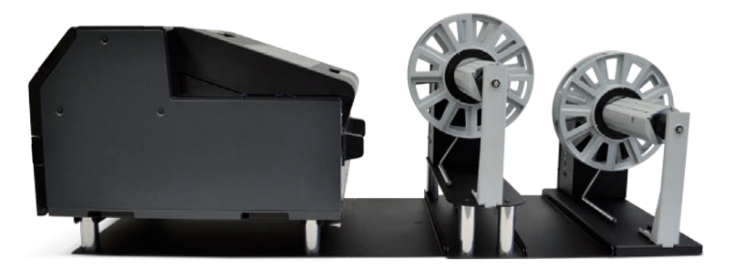
Epson C650DP printer - LABEL UNWINDER (UW6500P) - LABEL REWINDER (RW6500P) (Not included)

The Roll to Roll system specifically designed for Epson C6000P/C6500P color label printer can handle rolls up to 220mm (8.66") media wide and having an outside diameter up to 250mm (10"). Both Unwinder and Rewinder are equipped with a fixed 3" core holder.