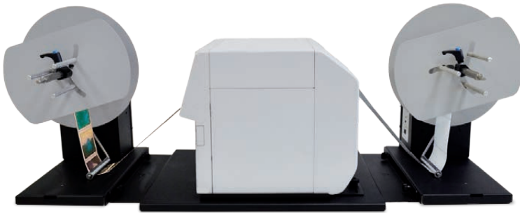
LABEL REWINDER (ASD1111-S0) - Epson C4000 printer - LABEL UNWINDER (ASS1111-S0) (Not included)

The new Unwinding/Rewinding system for Epson C4000 Label Printer can handle media up to 127mm (5") wide and unwind/rewind label rolls having outside diameter up to 250mm (9.84"). Units are equipped with a 3" or adjustable core holder from 40 to 118mm (1.57" - 4.64").